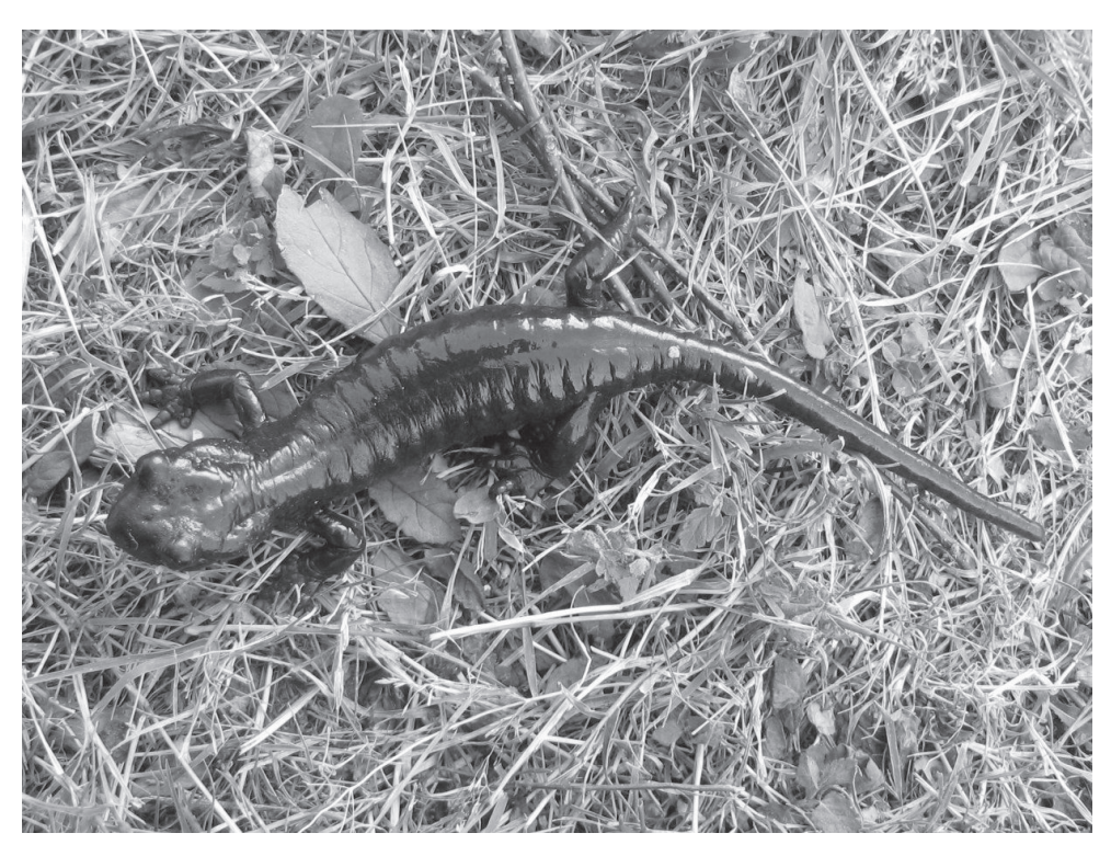
Fig. 1. The female of Salamandra lanzai, photographed in the Upper Sangone Valley.

at 94 °C for 45 s, annealing at 55 °C for 45 s and extension at 72 °C for 90 s, and a final extension of 300 s at 72 °C. PCR products were loaded onto 1% agarose gels, stained with ethidium bromide, and visualised on a "Gel Doc" system (PeqLab). If results were satisfying, products were purified using QIAquick spin columns (Qiagen). The light strands were sequenced using an ABI3730XL by Macrogen Inc. (sequences GenBank accession numbers: EF191028- EF191041). Sequences were manually edited and aligned using the BioEdit sequence alignment editor (version 7.0.5, Hall, 1999).